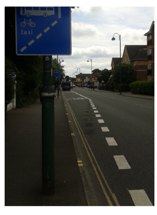
2, Shirley Road – start of bus lane