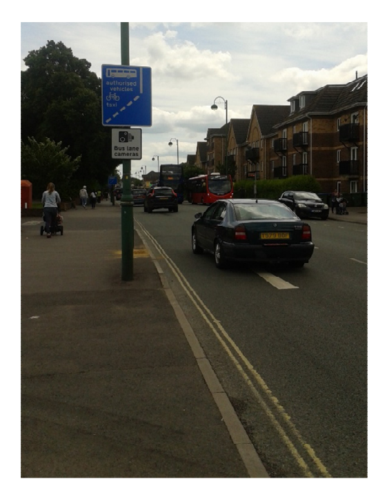
1, Shirley Road - approach