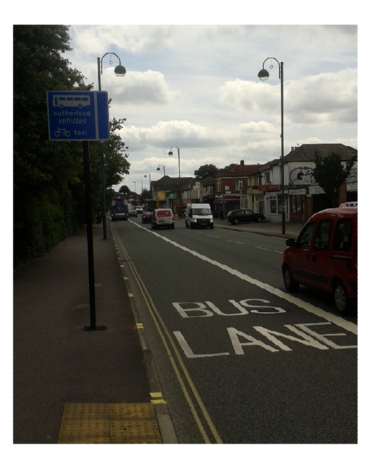
6, Shirley Road – bus lane