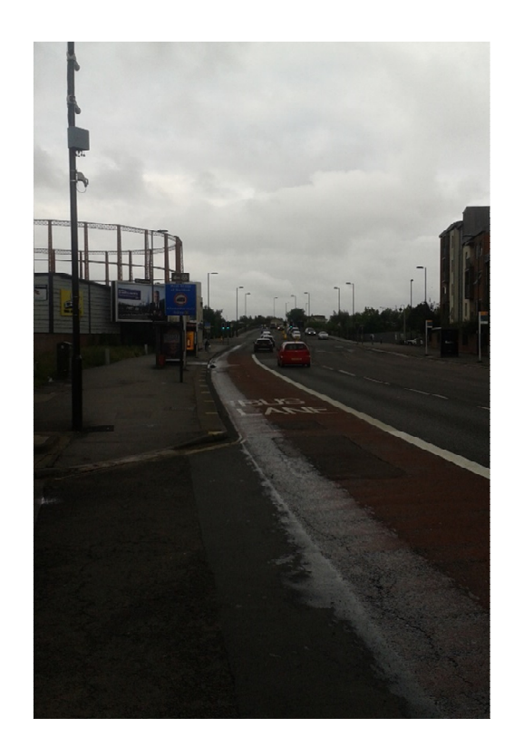
8, Northam Road – bus lane