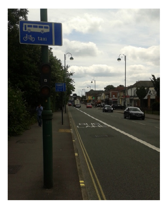
5, Shirley Road – bus lane